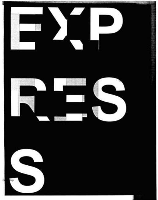
Adam Pendleton, IF THE FUNCTION OF WRITING , detail, 2017 Courtesy the artist, and Galeria Pedro Cera, Lisbon