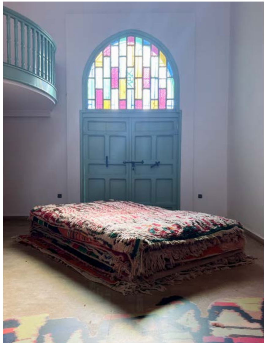
School of Casablanca, exhibition view, La Coupole, Casablanca